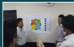
Debrief with peers & receive feedback