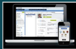
Read simulated company website