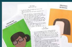
Receive sales intelligence & challenge assumptions