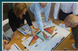
Work together to build your strategy