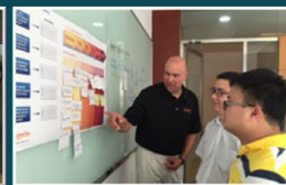
Plan for a successful meeting